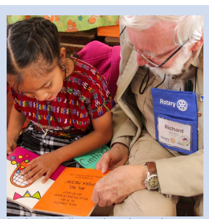
During CoEd's service trips, volunteers spend time reading with Spark students, seeing firsthand how the program has impacted their learning. Sacatepéquez, February 2023.

In the post-pandemic context, re evaluating and listening to